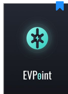
EVPoint in Germany